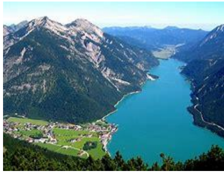
Our first hike will be from the lake Achensee up to exactly this point of view