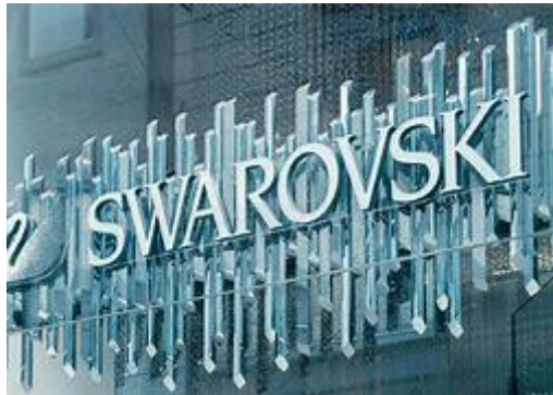
Visit of the Swarovski factory