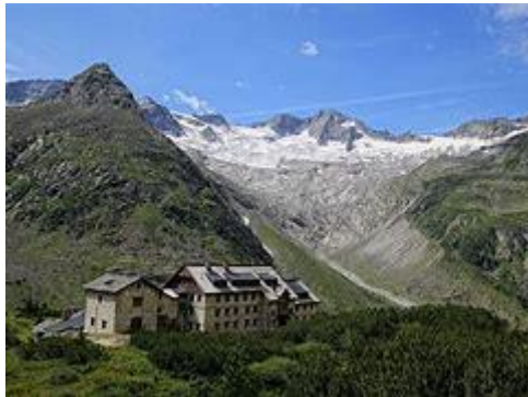
Die Berliner Huette – one of the huts we will stay in overnight during the hike