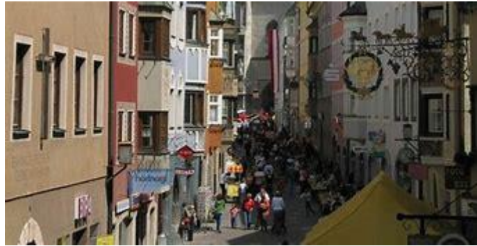
City of Schwaz, where you will be hosted