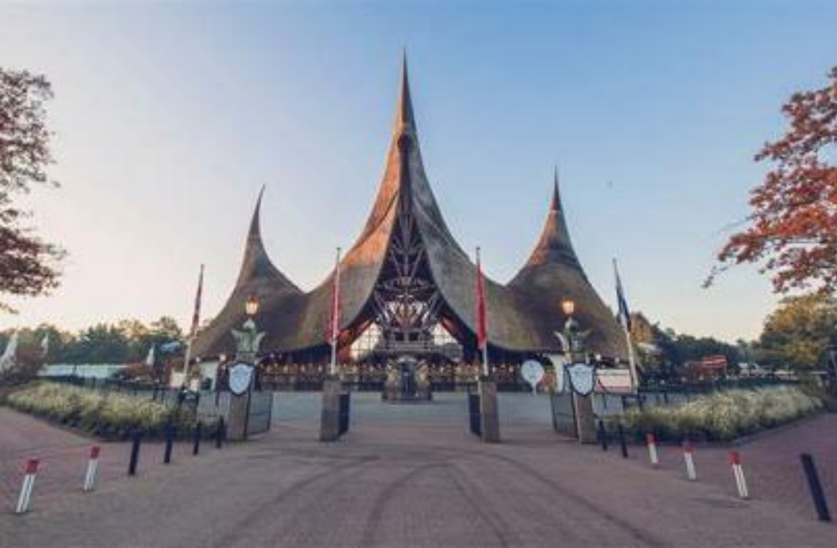
Tuesday 11 July Discover the largest themepark in the Netherlands Efteling: "world of Wonders"